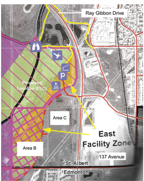
Lois Hole Centennial Provincial Park Management Plan, February 2019, Map 2 - Park Zoning, Page 100.

The provincial park suffers from a shortage of upland area to provide sufficient refuge for viable populations of wildlife and to provide access and facilities to the million or so people of the capital region, and tourists from outside the region, expected to use the park in future. Which is why Alberta Parks has actively pursued upland purchases around the park.