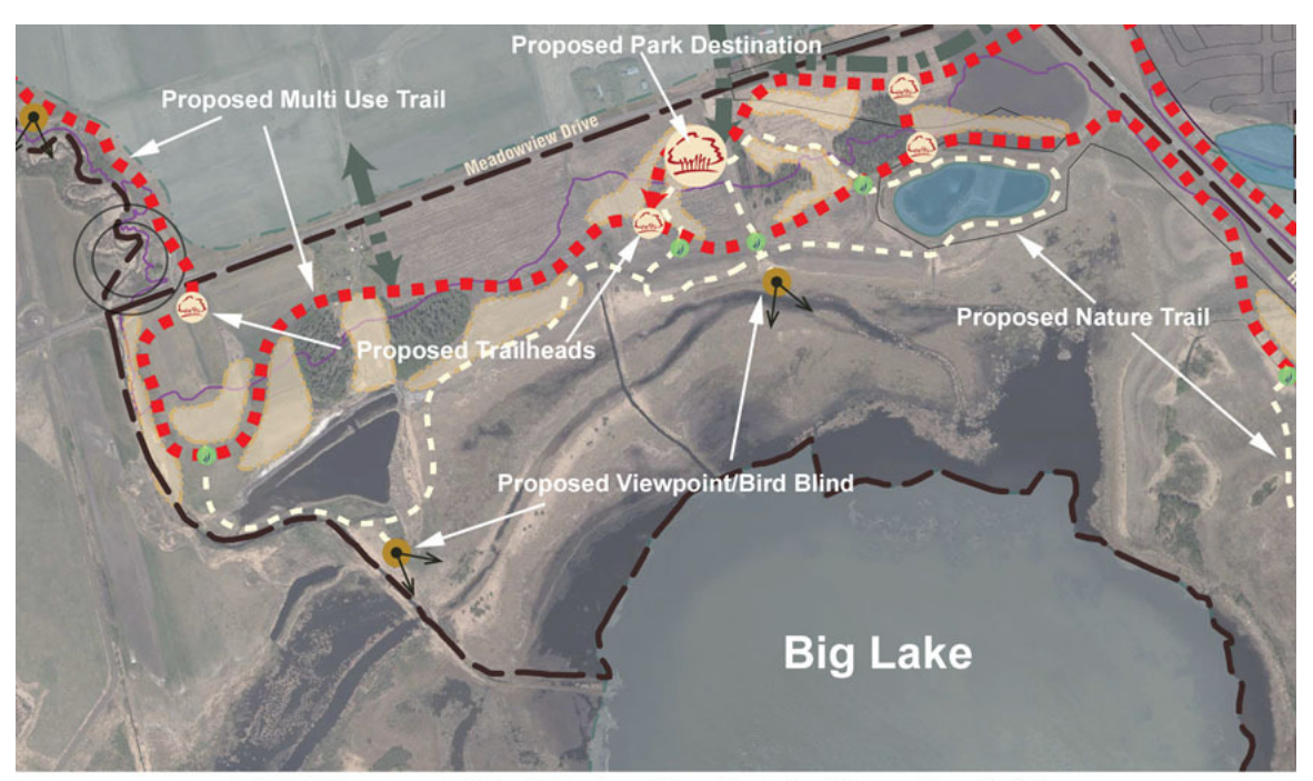
Red Willow park West Master Plan Update, November 2018 Figure 3.5, North Big Lake Concept

The new MDP expands the Employment Area designation into a narrow strip of land south of Meadowview Drive. This change contradicts the City's Red Willow Park West (RWPW) Master Plan, which was prepared in 2018/19 and was subject to extensive public engagement. The land south of Meadowview Drive is proposed in the RWPW plan to be a park destination with extensive trails and facilities for public enjoyment, see the maps below taken from the plan.