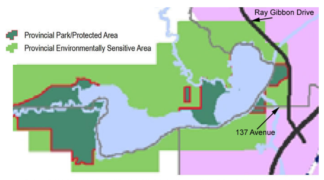
Edmonton Metropolitan Region Growth Plan, Schedule 4, Natural Living Systems, Page 45

The regional growth plan developed by the Edmonton Municipal Region Board in 2017 and updated in 2020 states at Section 2.1.2 on Page 44: "The Region will work together to conserve and restore the function, integrity and connectivity of natural living systems for the long term ecological and social benefit of the Region...". Included in the list of areas to be conserved and restored are the Provincial Environmentally Sensitive Areas outlined on the following plan.